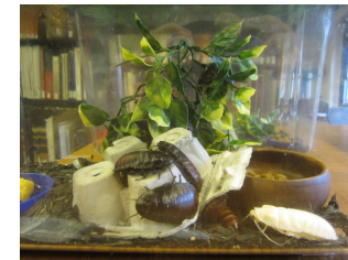
Group with newly hatched nymph, bottom right