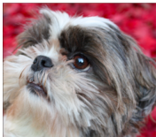
Cooper (Countway Library of Medicine)