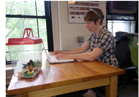
Therapy roaches assisting patron writing her dissertation