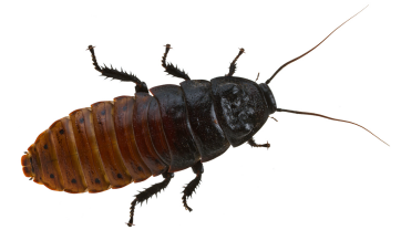
Photo of roach

... Dogs for Animal- or Pet-Assisted Therapy are becoming more common ...